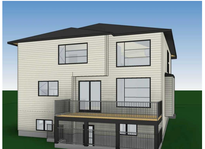
24 N Bridges Glen, Langdon, AB