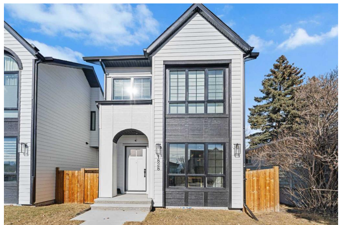
Client: Tri Nhan Le - EXP Realty Address: 1828 18 Ave NW, Calgary Level: Basement