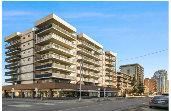
502, 1334 12 AVENUE SW RECA MEASUREMENT STANDARD - CALGARY AB MAIN LEVEL (AG) - 901.32 Sq Ft / 83.73 m 2 TOTAL ABOVE GRADE RMS SIZE - 901.32 Sq Ft / 83.73 m 2

**Hold on to your Hat** Value!!! Shop & compare. Indoor parking! Plus, 2 months prepaid condo fees! Views overlooking the downtown and the west side. This is the most popular model/floor plan with 900 square feet in the sought-after "The Ravenwood" concrete building with two bedrooms, a bathroom, one indoor heated parking space, newer countertops, an oversized covered balcony, and a remodeled kitchen & modern design. Additionally, the property features upgraded laminate flooring (no carpet), in-suite laundry, newer windows, bathroom fixtures, and appliances. Large Primary bedroom with a closet. Titled parking in a secure, heated underground parkade. You are also within walking distance of anything you need, with the Sunalta LRT just minutes away for added convenience. Close to Sunalta Elementary School, Connaught School, and West Canada High School, the Bow River pathway offers access to medical facilities, shopping, grocery stores, coffee shops, and much more. QUICK May 01, 2025 possession is available - ACT FAST! You can call your friendly REALTOR(R) to book you viewing.